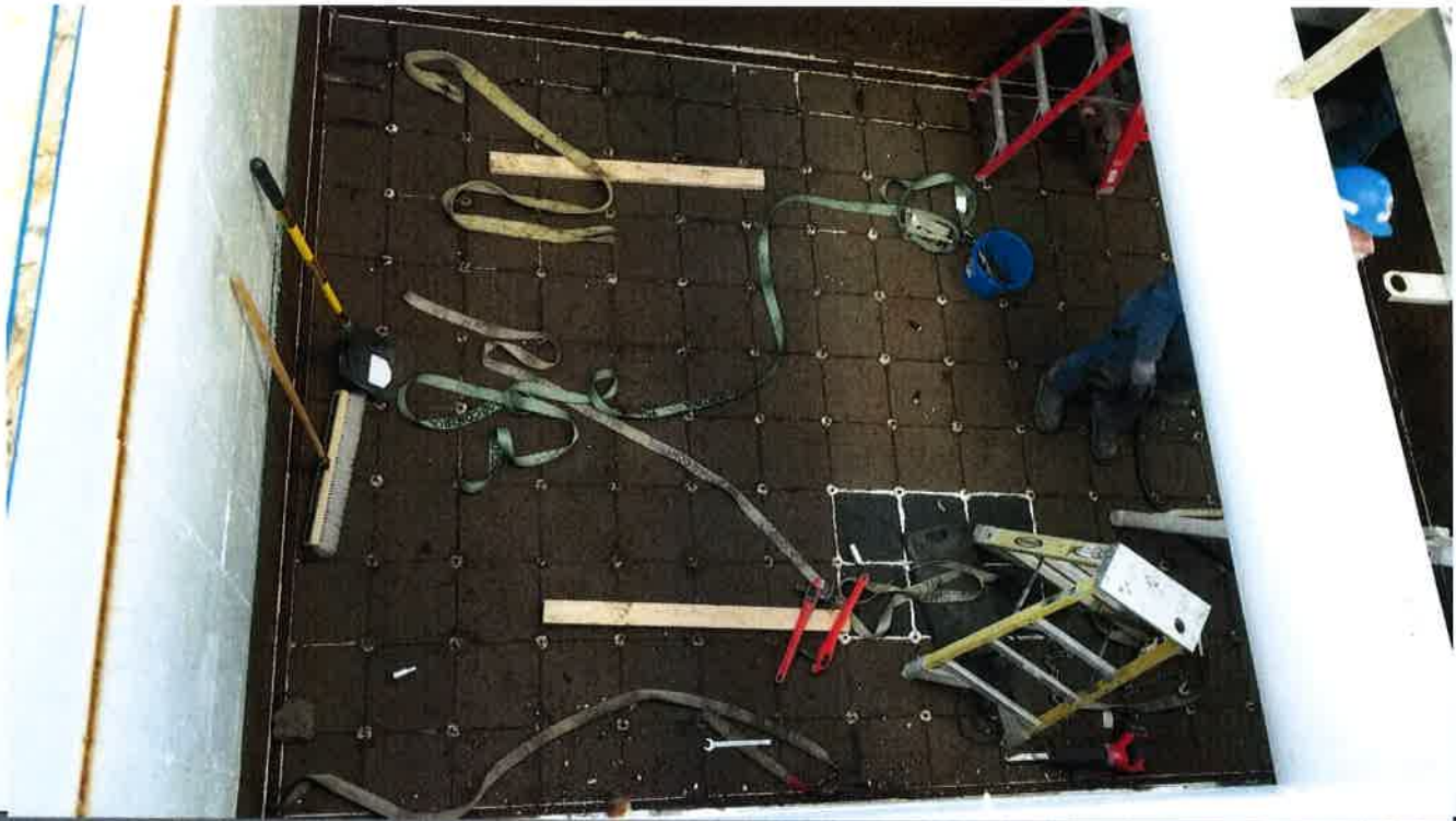
Before Demo of Old Underdrain